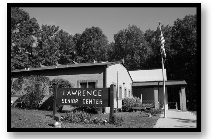
Lawrence Township Senior Center 30 Darrah Lane East

The Lawrence Senior Center is open to Lawrence Township residents 60 years of age and older. The Senior Center offers a wide range of social, recreational and educational activities as well as a library/lounge where seniors are welcomed to relax, socialize, watch television, play board games or read. Perhaps you will consider participating in the excursions they offer. A nutritious lunch is served by the Mercer County Nutrition Project on Mondays, Wednesdays, Thursdays and Fridays. The Lawrence Township Office on Aging publishes a monthly "Lawrence Senior Activities and Events Calendar" to keep seniors updated on the programs being offered at the Senior Center. The Lawrence Senior Citizen van is available to provide transportation for Lawrence seniors Monday through Friday. Call the Office on Aging at (609) 844-7048 for more information, transport assistance guidelines and to schedule appointments. The Senior Center is open Monday through Friday from 8:30 a.m. to 4:30 p.m., excluding holidays.