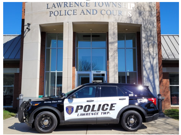
of Dedicated Service