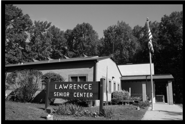
Lawrence Township Senior Center 30 Darrah Lane East

The Lawrence Senior Center is open to Lawrence Township residents 60 years of age and older. The Senior Center offers a wide range of social, recreational and educational activities as well as a library/lounge where seniors are welcomed to relax, socialize, watch television, play board games or read. Perhaps you will consider participating in the excursions they offer. A nutritious lunch is served by the Mercer County Nutrition Project on Mondays, Wednesdays, Thursdays and Fridays. The Lawrence Township Office on Aging publishes a monthly "Lawrence Senior Activities and Events Calendar" to keep seniors updated on the programs being offered at the Senior Center. The Lawrence Senior Citizen van is available to provide transportation for Lawrence seniors Monday through Friday. Call the Office on Aging at (609) 844-7048 for more information, transport assistance guidelines and to schedule appointments. The Senior Center is open Monday through Friday from 8:30 a.m. to 4:30 p.m., excluding holidays.