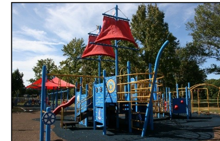
Captain Lawrence Playground Central Park

Armory Fields Twin Pines- Steven J. Groeger Fields Mooch Myernick Training Facility at Village Park Zimmer Field in Central Park