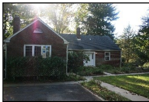
Lawrence Nature Center 481 Drexel Ave, Lawrence, NJ

Adult Volleyball Safety Town Art Classes Summer Camps Community Gardens Swim Lessons Lawrence Lightning Swim Team Tennis Lessons Nature Center Camp Track Swimming Pool Membership Youth Basketball Youth Police Academy Wrestling